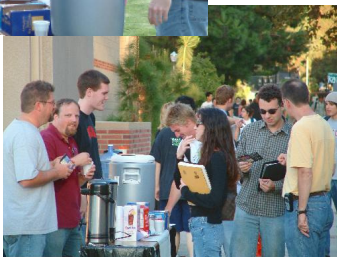
Left: the winner of the pudding game won an iPod nano.