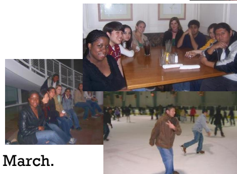
Activities: Students at the Getty Museum and at a restaurant afterwards (far left and top left), a student ice skating (left)

Every month we plan an activity to build deeper relationships with each other and to invite students who might not typically come to a worship service. At the beginning of the second quarter we had a welcome back party, we visited the J. Paul Getty Museum in February, and we had fun ice-skating in March.