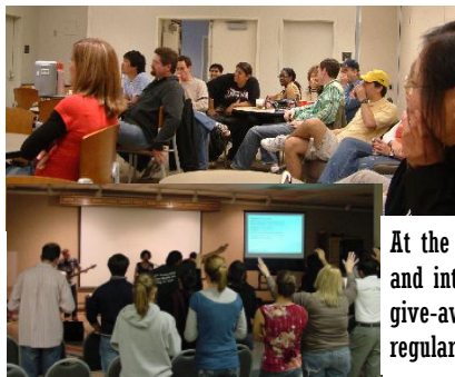
At the dorm talk (top left), lines and interaction at the milk shake give-away (top), worship at our regular service (left)