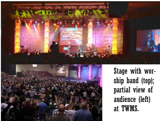
Stage with worship band (top); partial view of audience (left) at TWMS.