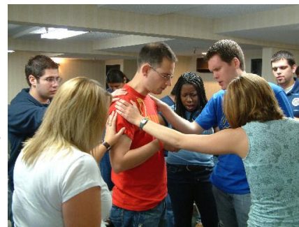
Students and staff praying for me, my trip to Germany and the message for the Chi Alpha group in Berlin.