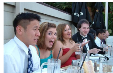
Celebration at the Final Banquet